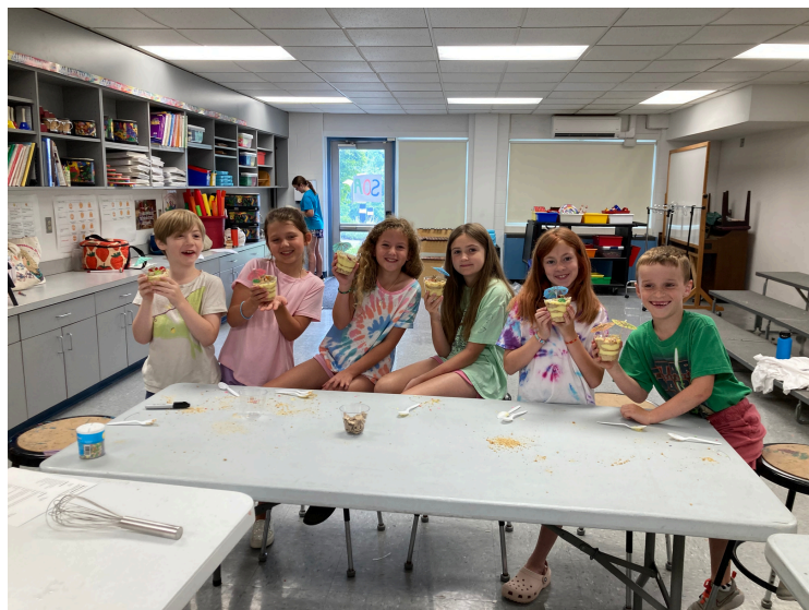
Summer Camp 2024