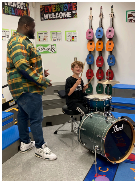
Blues & Beyond