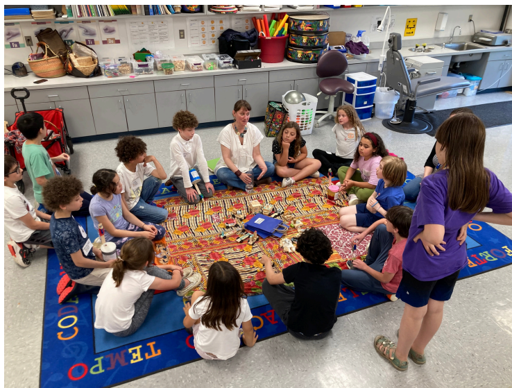
Flying Cloud Institute