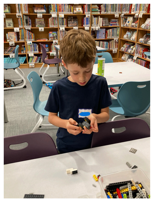
Lego Engineering: Minecraft