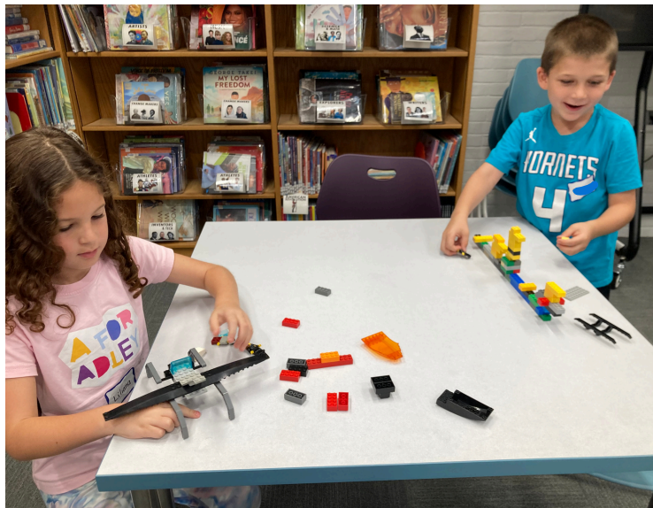
Lego Engineering: Animal Adventures