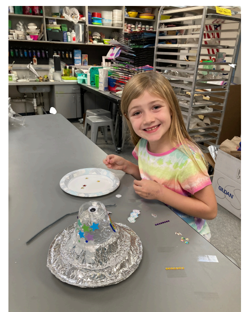
Art in Motion